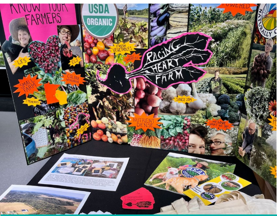
PICTURED: 2024 RACING HEART FARM CSA TABLE

Seasonality also plays a crucial role at the Co-op,