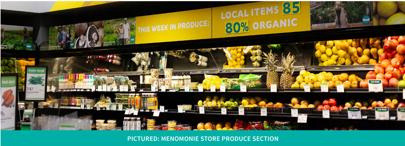
PICTURED: MENOMONIE STORE PRODUCE SECTION

Meetings are usually scheduled from 5:30pm-7:30pm on the fourth Tuesday of every month. They are currently being held in person and online and rotate between Menomonie, Eau Claire and Teams. All board meetings, except for closed sessions, are open to owners. Learn more about how to attend on our website or in our entryway.