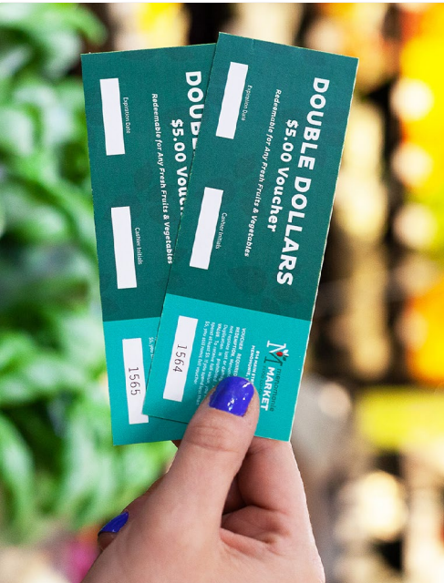
PICTURED: DOUBLE DOLLAR VOUCHERS

Thank you to our shoppers, your donations have made a positive impact in our community. Together, we will continue to enhance the lives of our friends and neighbors.