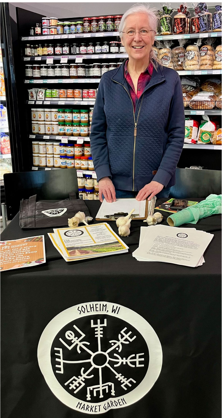
PICTURED: 2024 SOLHEIM FARM CSA TABLE

Local Shopping Statistics: Facts on Buying Local - Fundera Ledger