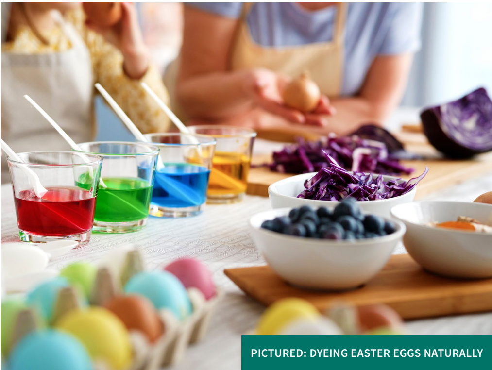
PICTURED: DYEING EASTER EGGS NATURALLY