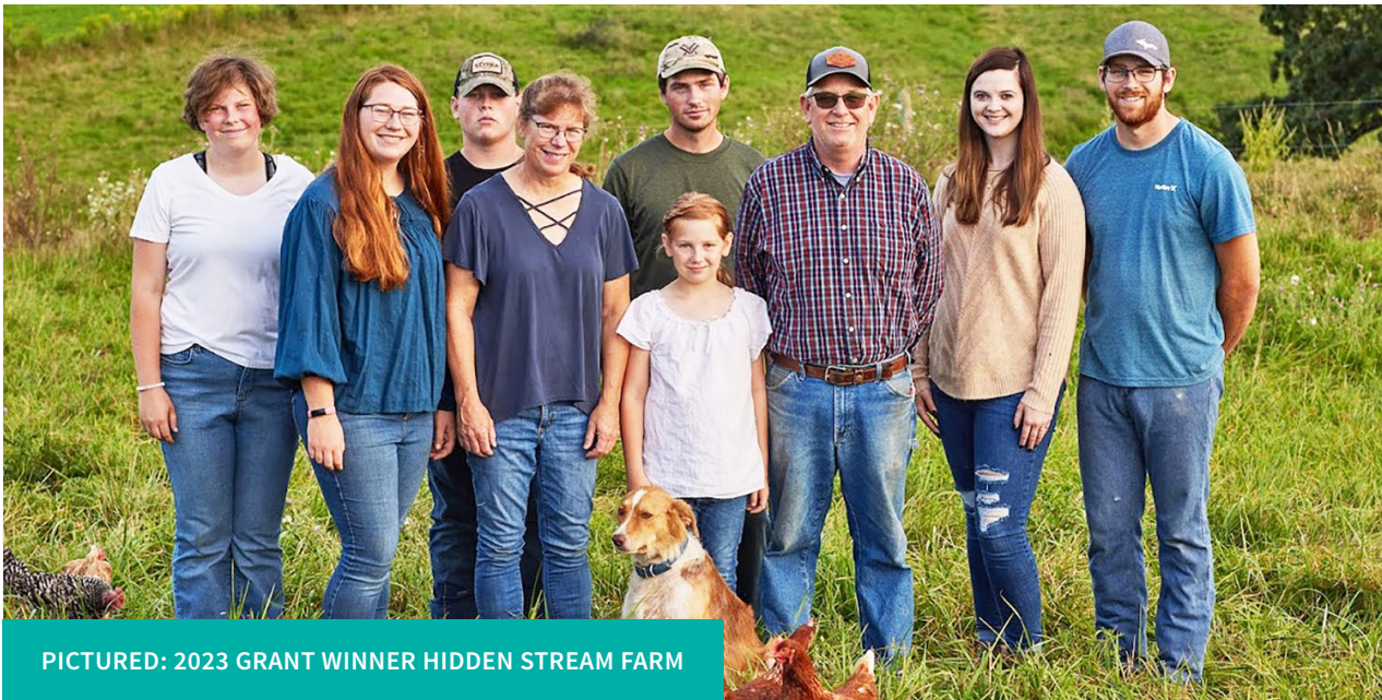
PICTURED: 2023 GRANT WINNER HIDDEN STREAM FARM